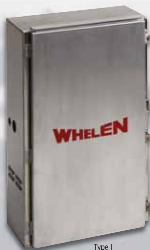
Type I Electronic Cabinet